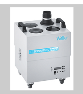
Fume extraction devices