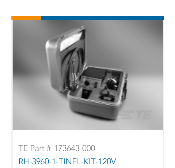
Also in the Series | RAYCHEM TXR