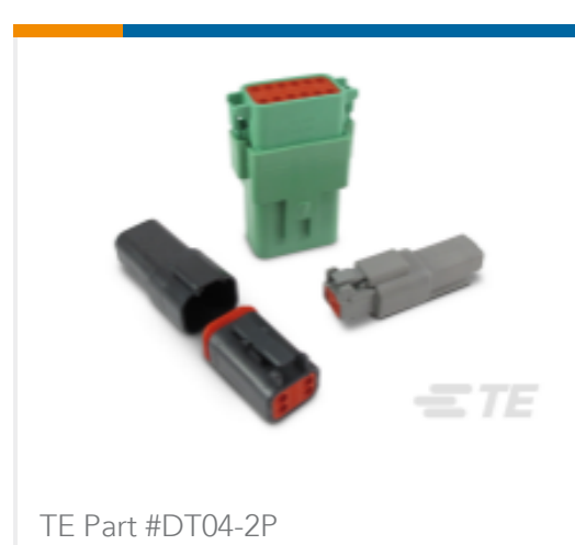
DEUTSCH DT HOUSINGS