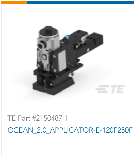
TE Part #2150487-1 OCEAN_2.0_APPLICATOR-E-120F250F