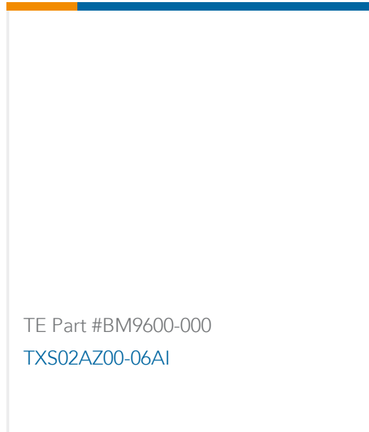
TE Part #BM9600-000 TXS02AZ00-06AI