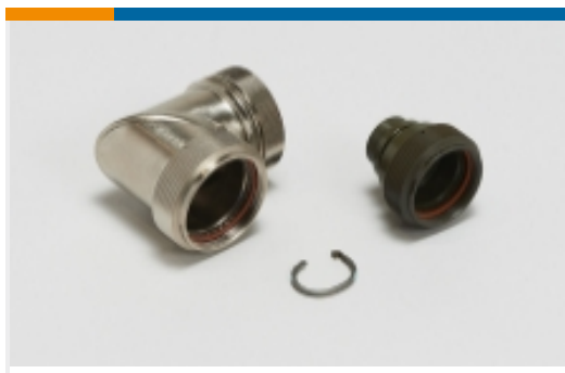
Screened Backshells & Adapters(6)