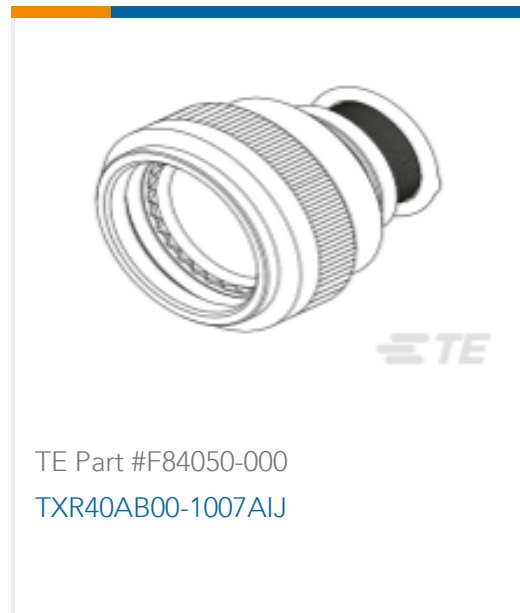
TE Part #F84050-000 TXR40AB00-1007AIJ