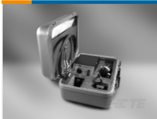
TE Part # 173643-000 RH-3960-1-TINEL-KIT-120V