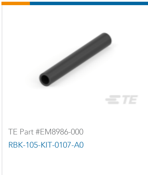
TE Part #EM8986-000 RBK-105-KIT-0107-A0