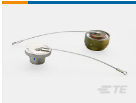
TE Part #YDIV51W21RV0010000 D38999: Circular Connector Caps and Covers