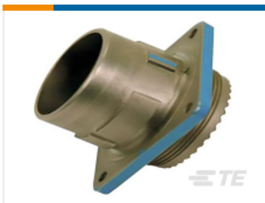
TE Part #YDIV46E13-98SAC009 PLUG ASSY