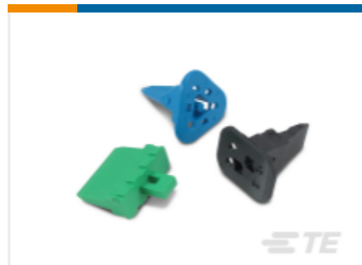
TE Part #W2S DEUTSCH DT WEDGELOCKS