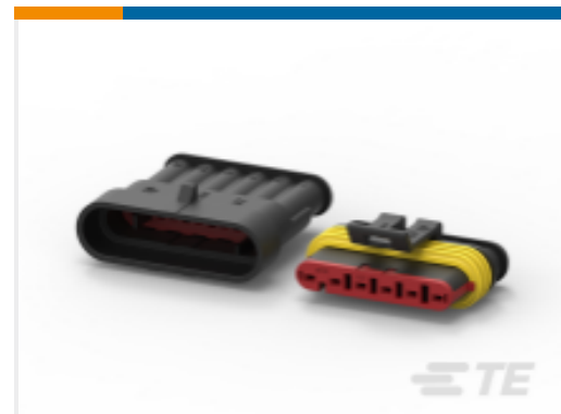
TE Part #282104-1 AMP SUPERSEAL 1.5MM, CONNECTOR HOUSING