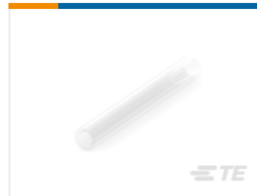
TE Part #NB15944001 RT-375-1/2-X-SP