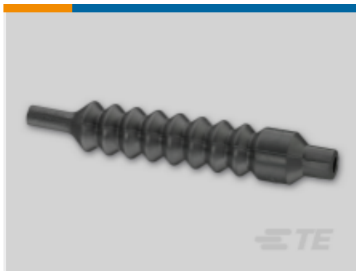
TE Part #806234-000 Convoluted HS Uni Boots Lipped, Straight