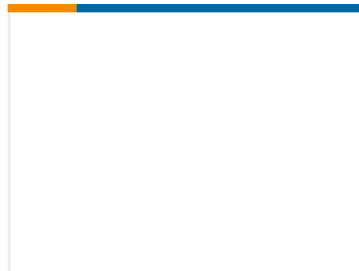
TE Part #BAB0177-00 TXR40AZ45-1005BI