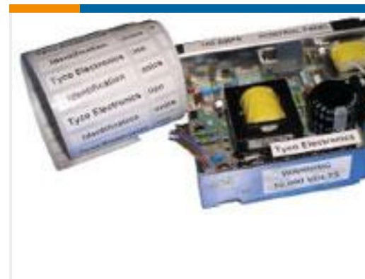
TE Part #483818-000 HPK02WE1050