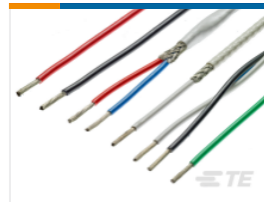
TE Part #265112-000 81044/9-18-0