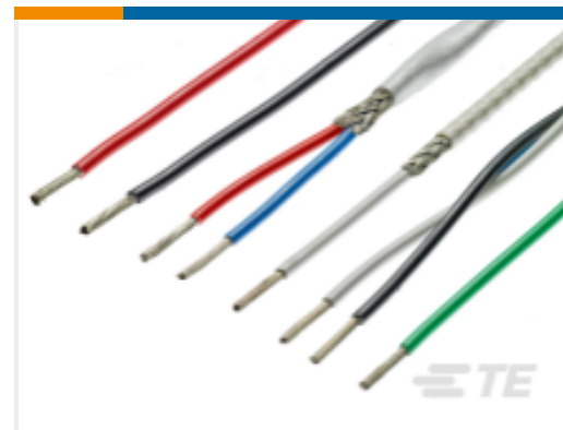
TE Part #845091-000 44A0131-20-9/93/96CS2275