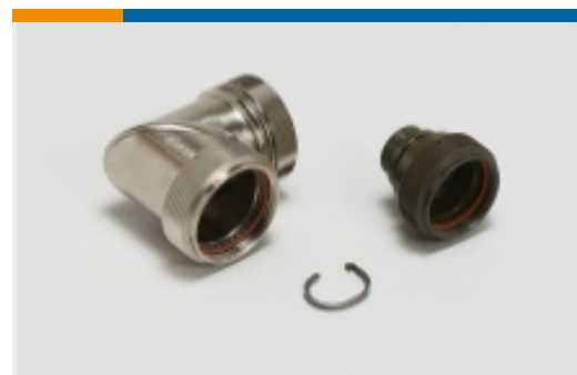
Screened Backshells & Adapters(1)