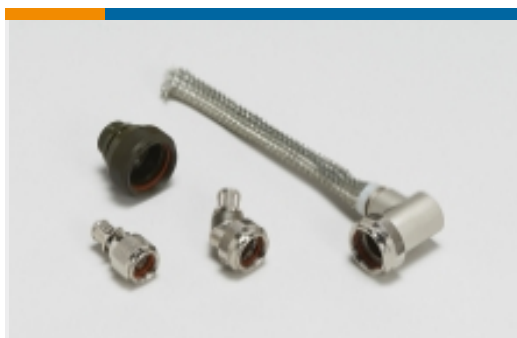
Ruggedized Backshells & Adapters (2071)