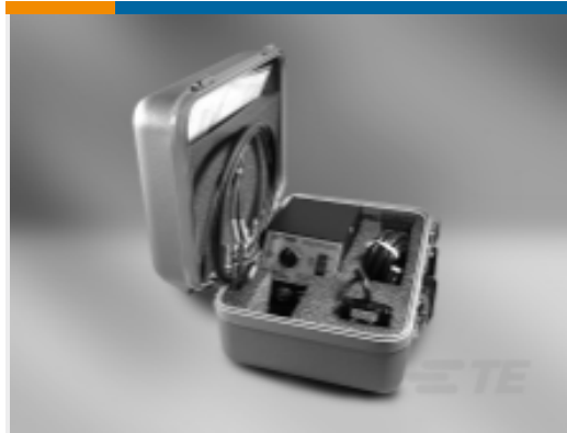
TE Part # 173643-000 RH-3960-1-TINEL-KIT-120V