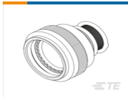
TE Part #675889-000 TX40AB00-1812