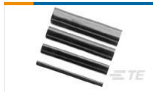
TE Part #CB5351-000 SST-48-11/FR/RED/97