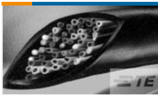
TE Part #D11555-000 NT-MIL-2-0-SP