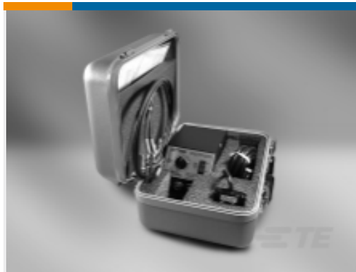
TE Part # 173643-000 RH-3960-1-TINEL-KIT-120V