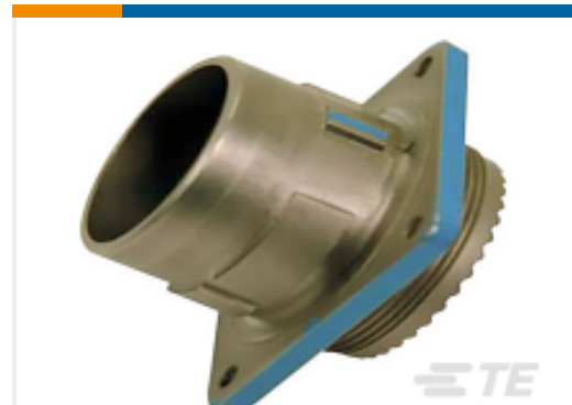
TE Part #YDIV40E15-18PNV001 RECP ASSY