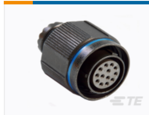
TE Part #YDTS26F19-35PBV001 PLUG ASSY