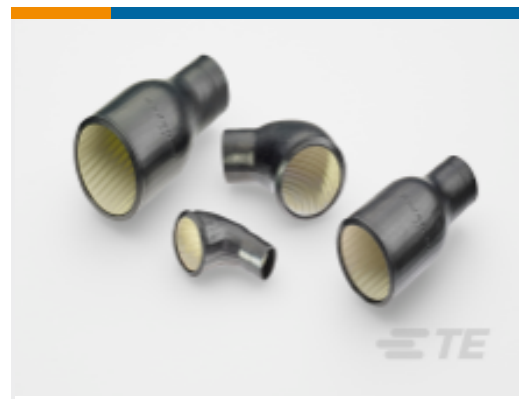
TE Part #EK7267-000 202S121-25C-0