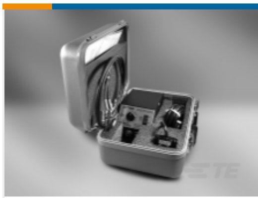
TE Part # 173643-000 RH-3960-1-TINEL-KIT-120V