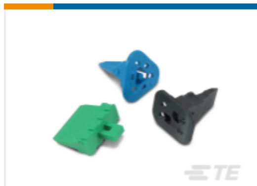
TE Part #W2S DEUTSCH DT WEDGELOCKS