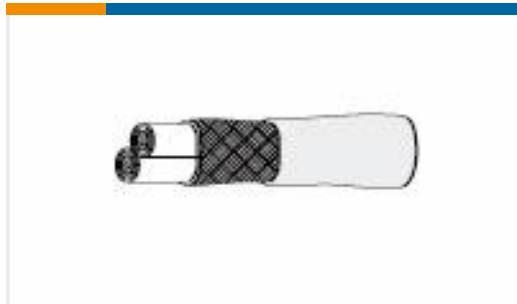
TE Part #131691-000 55A1112-16-9-9CS2275