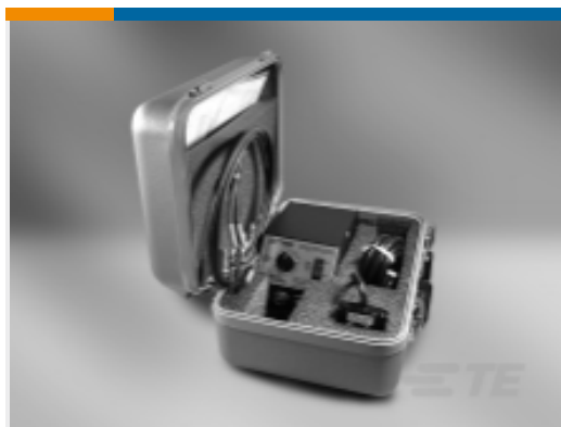
TE Part # 173643-000 RH-3960-1-TINEL-KIT-120V