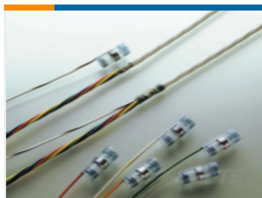
TE Part #460870N003 S02-07-R-9CS925