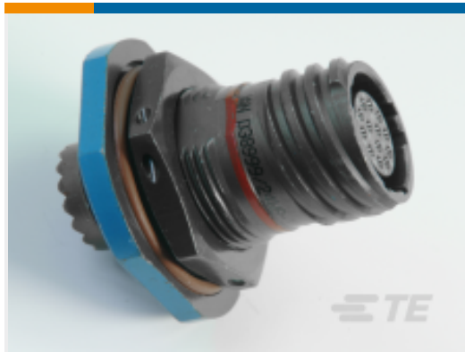
TE Part #YACT24JH35SAC00100 JAM NUT RECEPTACLE