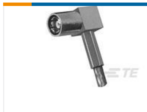
TE Part #415484-1 PLUG,CBL,MINI-SMB RTANG 75 OHM