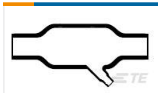
TE Part #820017-000 342A034-3/42-0