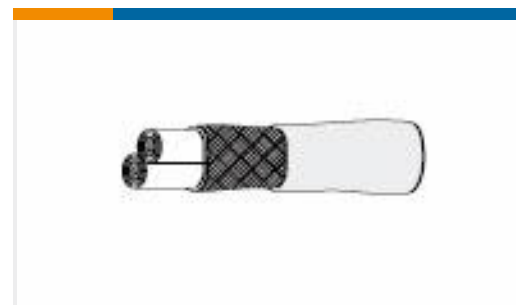
TE Part #431891-000 55A1141-24-MST4-9CS2275