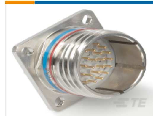
TE Part #YDTS20W23-21PAV001 RECP ASSY