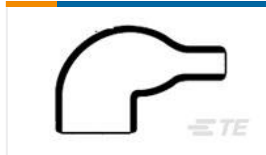
TE Part #813856-000 222A163-3-0