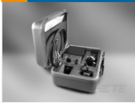
TE Part # 173643-000 RH-3960-1-TINEL-KIT-120V