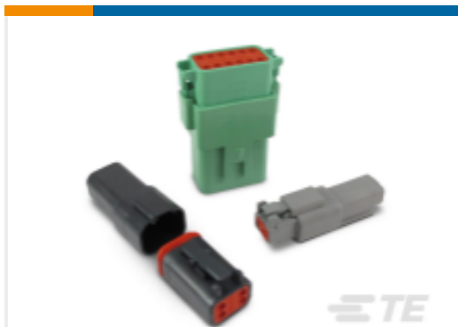
TE Part #DT04-2P DEUTSCH DT HOUSINGS