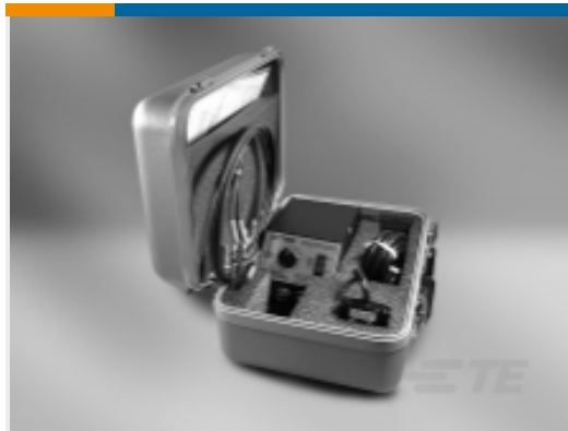
TE Part # 173643-000 RH-3960-1-TINEL-KIT-120V