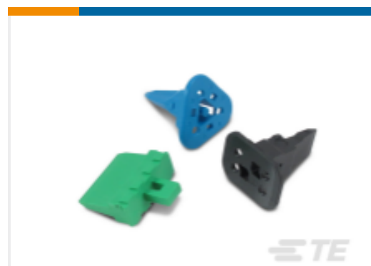
TE Part #W2S DEUTSCH DT WEDGELOCKS