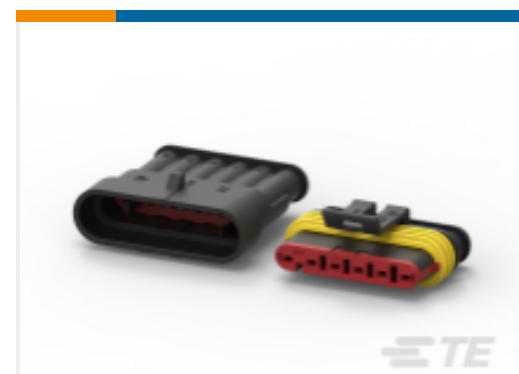
TE Part #282104-1 AMP SUPERSEAL 1.5MM, CONNECTOR HOUSING