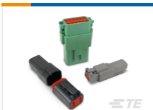
TE Part #DT04-2P DEUTSCH DT HOUSINGS