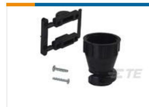
TE Part #206070-8 CABLE CLAMP KIT #17