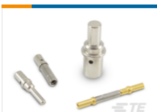
TE Part #0460-202-16141 DEUTSCH SOLID CONTACTS