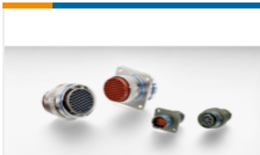
TE Part #YAFD54-20-41SNC012 RECP ASSY