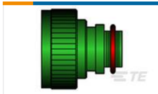
TE Part #229689-000 STXR54AB00-1008AI