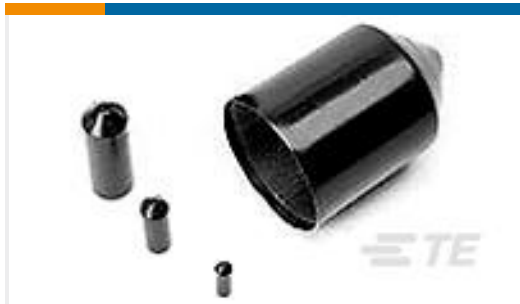
TE Part #843031-000 101A011-3-0