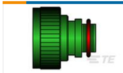
TE Part #641453-000 TXR54AC00-2008AI