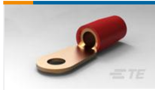
TE Part #324043 TERMINAL,T-N R 8 10