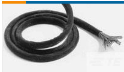
TE Part #5580614002 VPB-1-1/4-0-SP