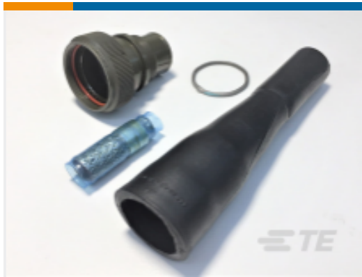
TE Part #249975N001 5436-10-561120-CS2359