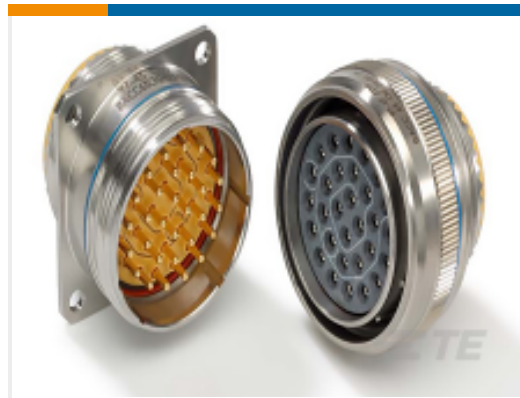
TE Part #ZPF000000000034582 983-1Y 14-15 PN