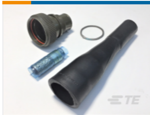
TE Part #165071N001 6116-10-340712-CS2359