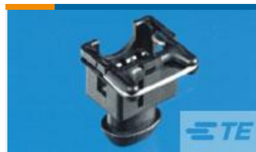
TE Part #963040-2 2P JUN-TIMER GEH