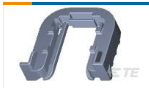
TE Part #1703810-1 SLIDE,TAB HSG GROUP B