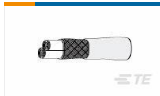
TE Part #3823063009 44A1121-16-0/9-9