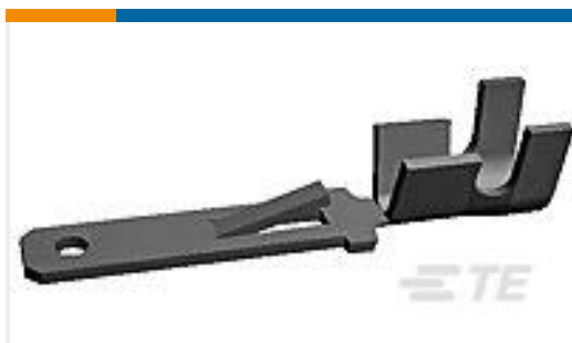
TE Part #42565-2 FF 250 TAB 18-14AWG TPBR PRE CRIMPED