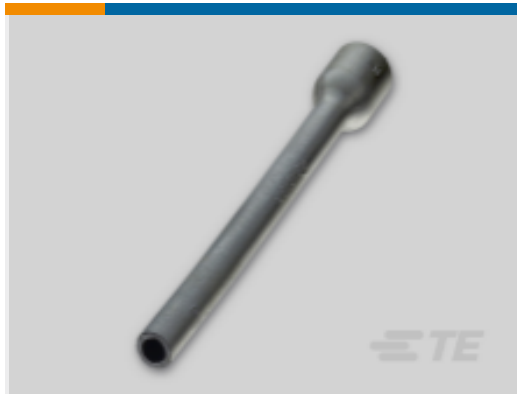
TE Part #868601-000 Low Profile Blow Mold: Lipped, Straight