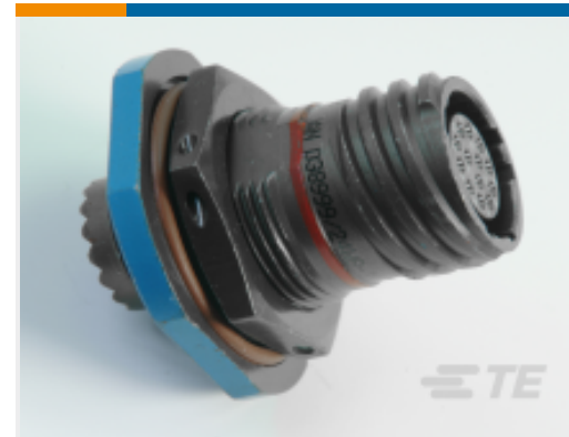
TE Part #YDTS24W11-05SNV001 RECP ASSY