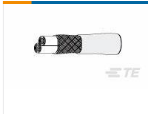
TE Part #382432-011 44A1121-18-0/9-9