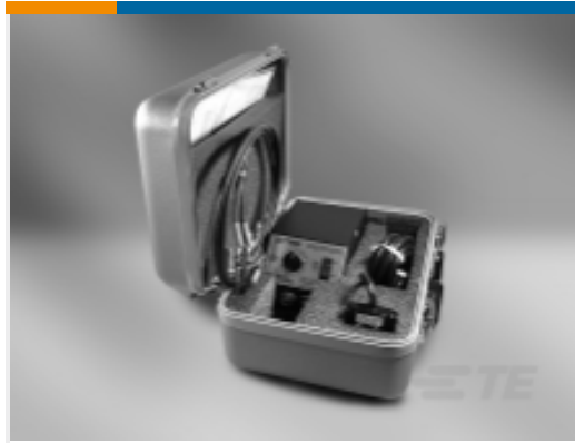
TE Part # 173643-000 RH-3960-1-TINEL-KIT-120V