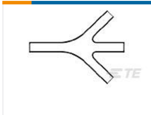
TE Part #060429-000 462A421-51/164-0