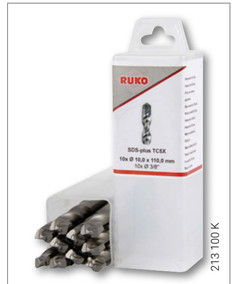
213 100 K