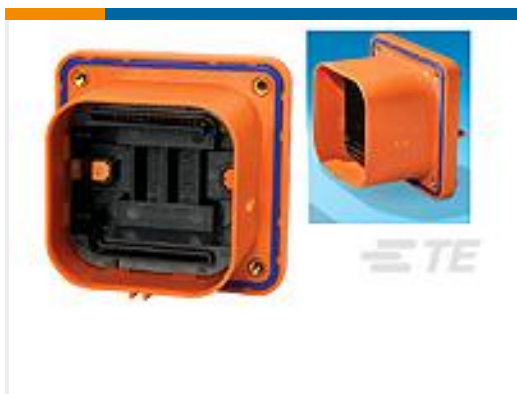
TE Part #1-1587987-7 RECEPTACLE ASSEMBLY, Shunt, MSD