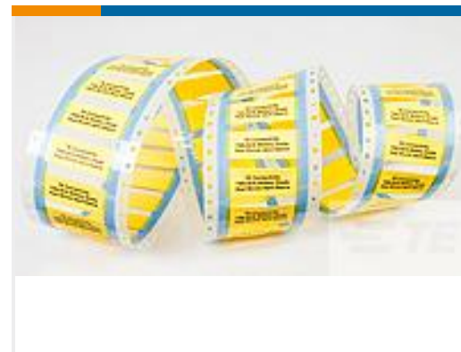
TE Part #A58166-000 TMS-SCE-2X-1K-3/8-9