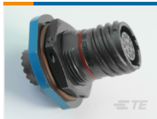
TE Part #DTS24W25-24SA D38999: Jam Nut, 25-24 Insert