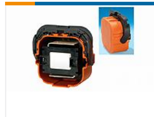
TE Part #1-2103172-7 Plug Assembly, Shunt, MSD