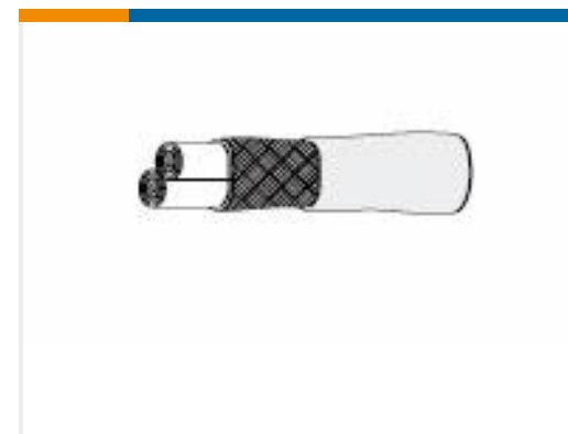
TE Part #050307-000 55A1122-22-9/96-9CS2275