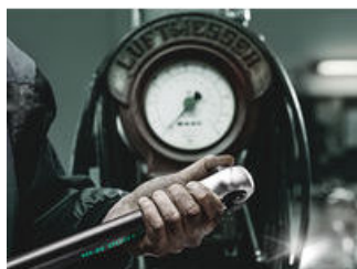
Reversing with square head insert