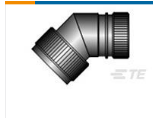
TE Part #CW1278-000 HEX54-SC-45-21-A11-1