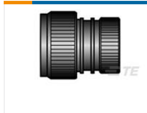
TE Part #542339-000 HEX40-AB-00-23-A10-1-DS