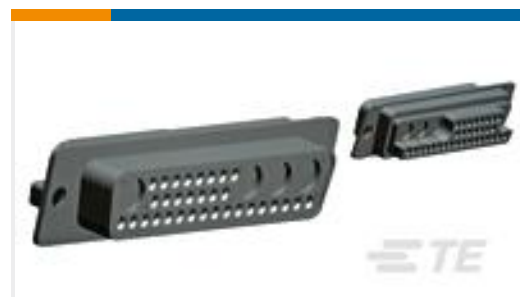
TE Part #208550-4 AMPLIMITE,ASY,RCPT,36C4,SN,CS,5